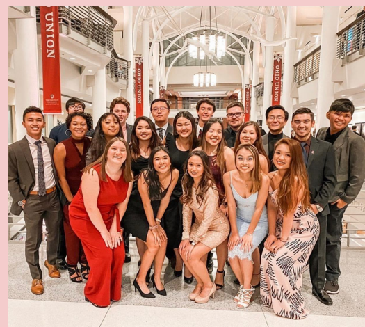
Attended OSU's AAA One Asian Nation event, where they recognized outstanding individuals within their community through a fashion show, talent show, and an inspiring Q&A segment to crown 2 winners!