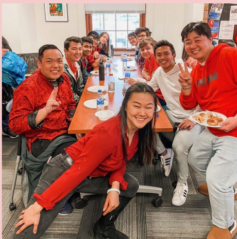
Celebrated Lunar New Year, a holiday widely celebrated in Southeast Asia, together with food and a red envelope exchange!