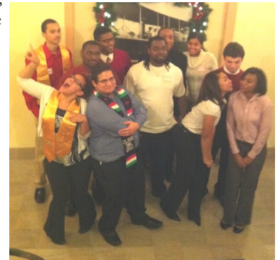
Fall 2011 Engineering Graduates

Career Services is also an invaluable resource for graduating seniors. Besides the Spring Career and Graduate Fair being held March 22, Career Services offers resumé writing workshops, interview trainings, job strategy sessions, and so much more. You can also upload your resume, search for jobs and internships, and post a profile on Hire a Flyer. This can help you immensely as you begin to look for more opportunities. But, still, taking the time to meet with a career adviser is perhaps the best step you can take. The office, located at Alumni House at 208 L Street, is open 8:30 a.m. - 4:30 p.m. Monday, Thursday, Friday, and 8:30 a.m. - 7:00 p.m. Tuesday and Wednesday. Walk-in hours are held 1 to 3:00 p.m. Mon.-Fri. You can visit http://careers.udayton.edu/ for detailed information, or call 937.229.2045.