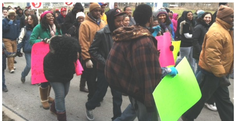
OMA participates in the annual MLK City Wide March